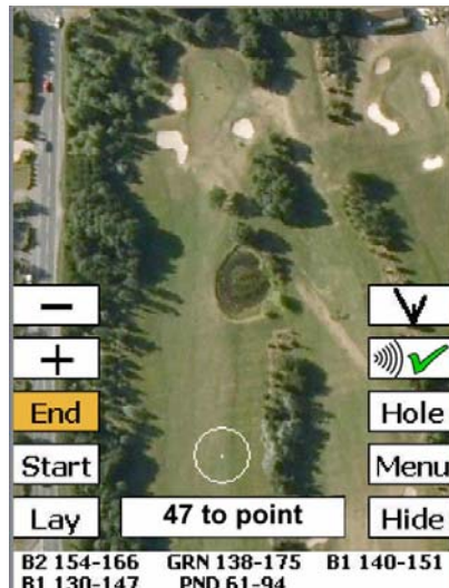
Manual readouts cont.

Press the Start button, and select where you want the reading from.