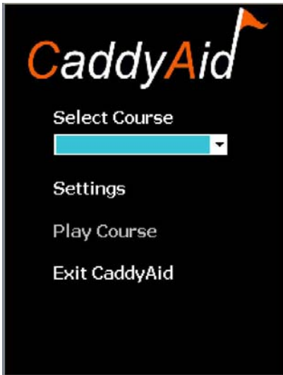
Select course and Play Course

Note, after the course has been loaded into CaddyAid, before play the Sirf Star 3 Configuration must be tested first and then the GPS Receiver . This only needs to be done once after purchase.