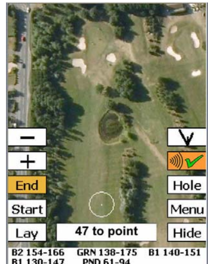
End positions from GPS

The distance between those two manually selected points will be shown